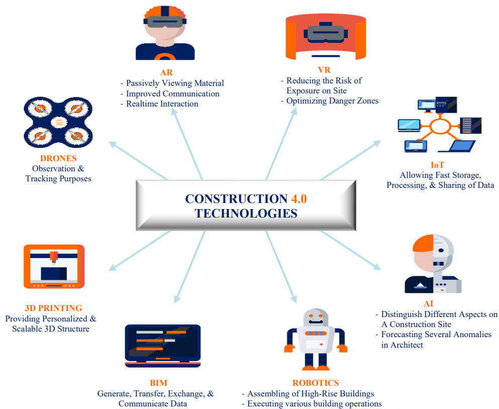
Figure 1: Construction 4.0 technologies

Computing, and Cybersecurity (Pereira et al., 2017) are all being analyzed through a multitude of conditions. While construction management is not a common scope of research, the results can be informative and relevant to the construction industry (Chris et al., 2017).